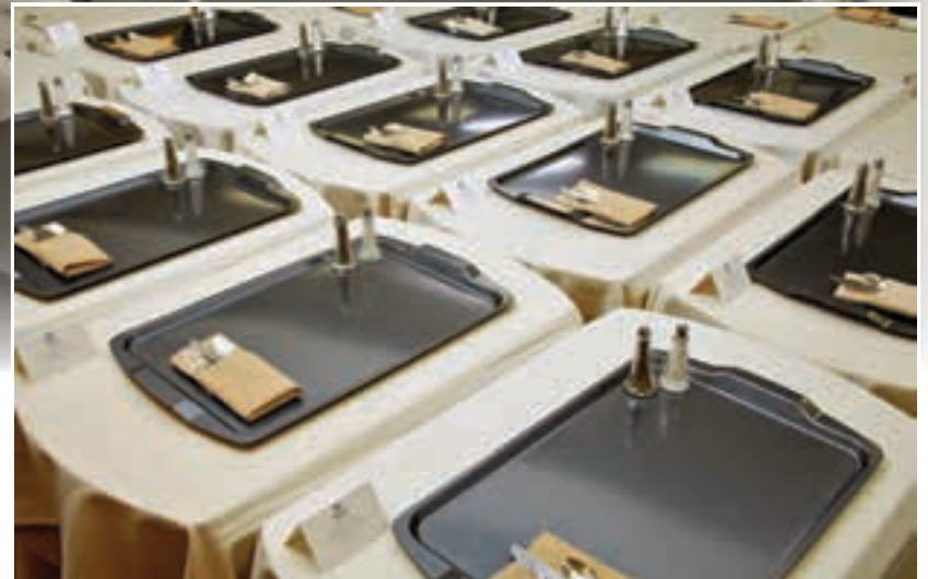
Hotel Room Service Trays