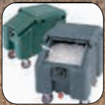
SlidingLid™ Ice Caddies

Such are scenes that play out every day at your establishment, warranting barware and equipment that serve up confidence for every occasion.