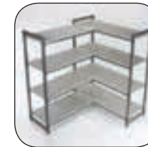
Camshelving Elements Series