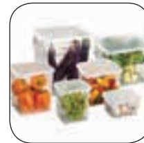
Storage Containers and Lids