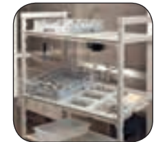
Camshelving® Divider Bars

A full array of hygienic storage and transporting systems for every warewashing need.