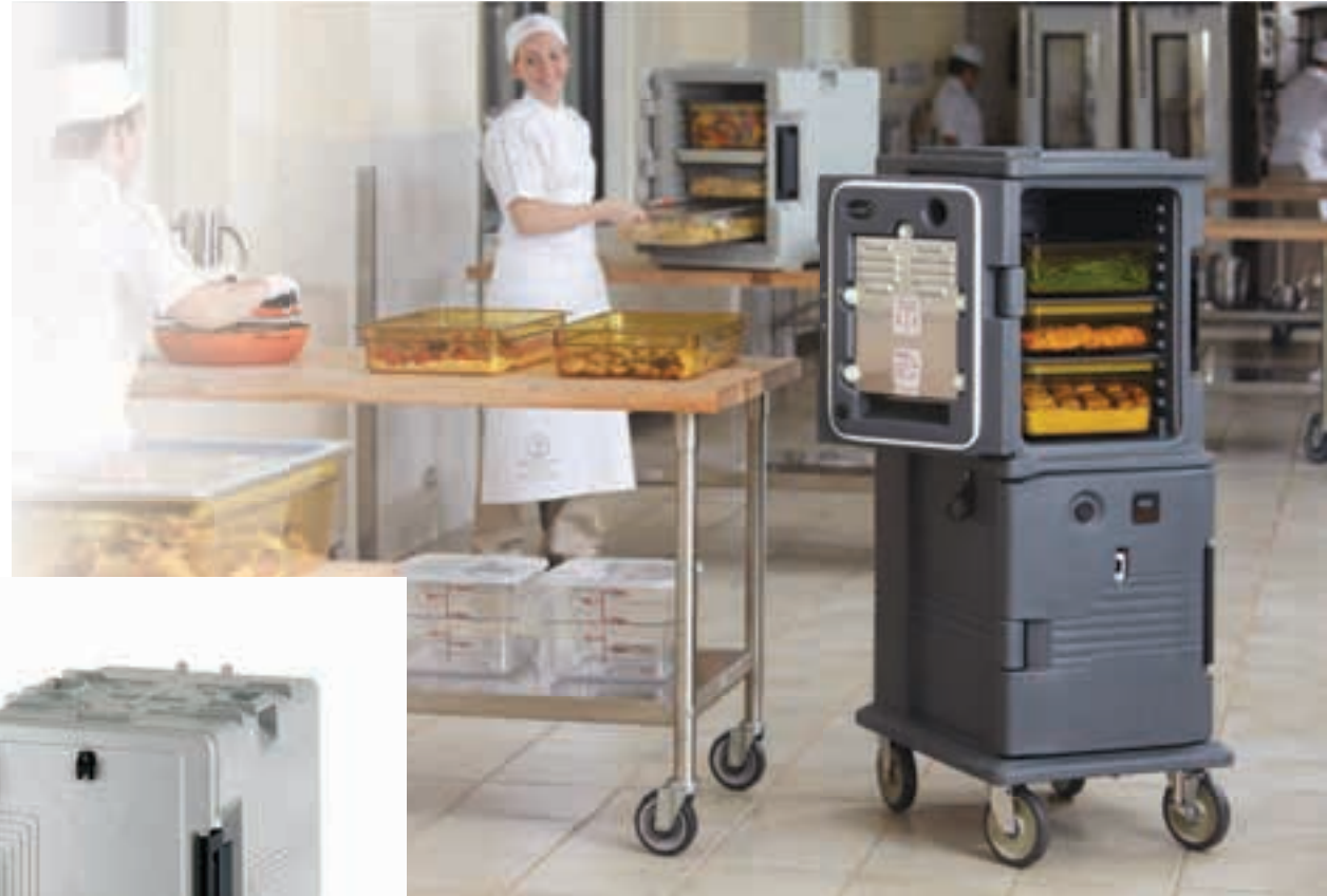
Insulated Holding Cabinets extend food holding time and ensure food safety at any event.

Ideal for large banquets and able to suit a variety of menu options needing hot or cold food holding, the cart also allows ease of transport to off-site events making your job, and your guests' event, a true celebration.